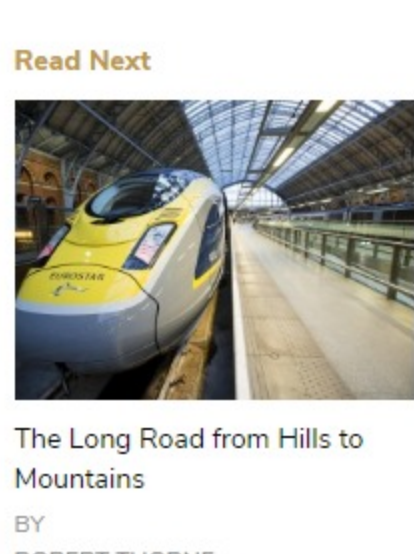
The Long Road from Hills to Mountains BY ROBERT THORNE

It's often thought that a ski resort can't have the best of both worlds. How often do you see quaint mountain resorts, all cobbled streets and wooden chalets, unspoilt by large apartment blocks, mass tourism or without a lengthy journey to the nearest ski area? Not often! So when we first visited the French resort of Samoëns, we could hardly believe that we had actually found an area that seemed to have the best of both!