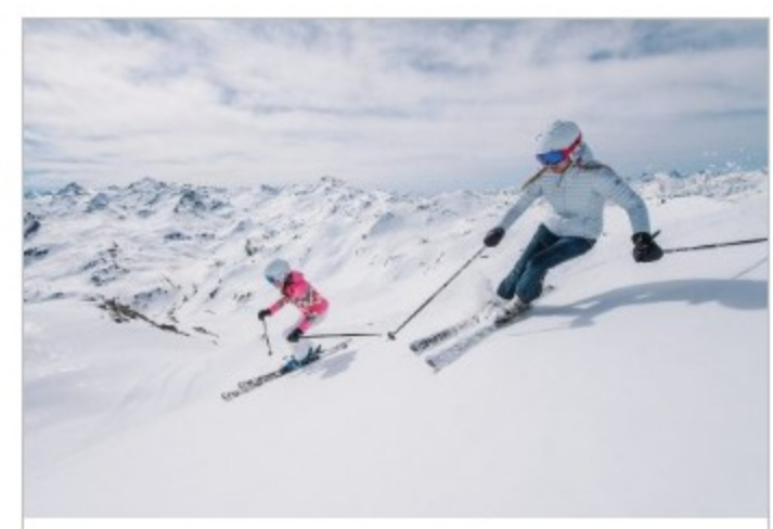
Feature The Secret, Authentic Resort in the World's Biggest Ski Area 31st October 2019