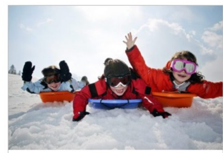
News Tour Op Launches Fun Family Challenge 10th October 2019