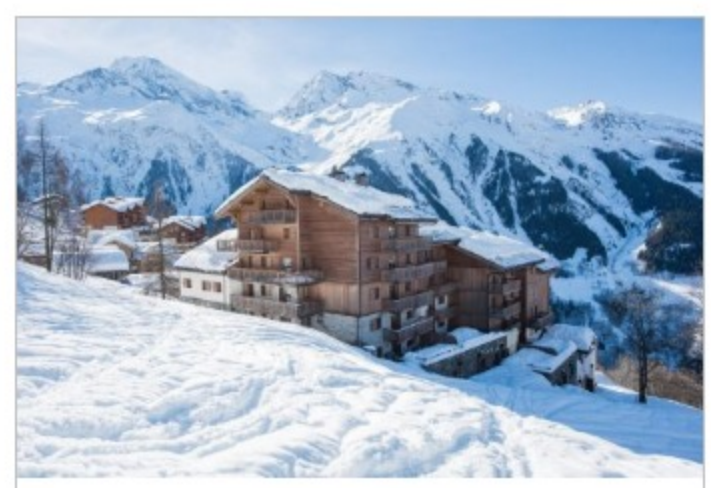
Feature Go Lux In The French Alps (It's Not As Much As You Might Think) 29th November 2019