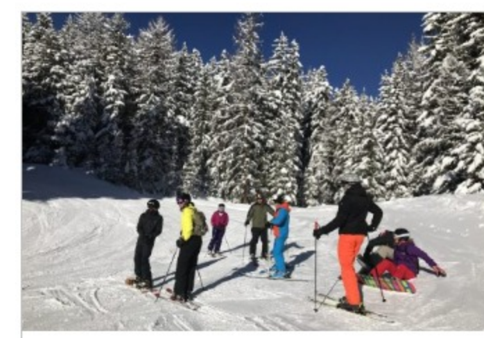
Editor's Picks Finding the Perfect Pistes of Paradiski 4th October 2019