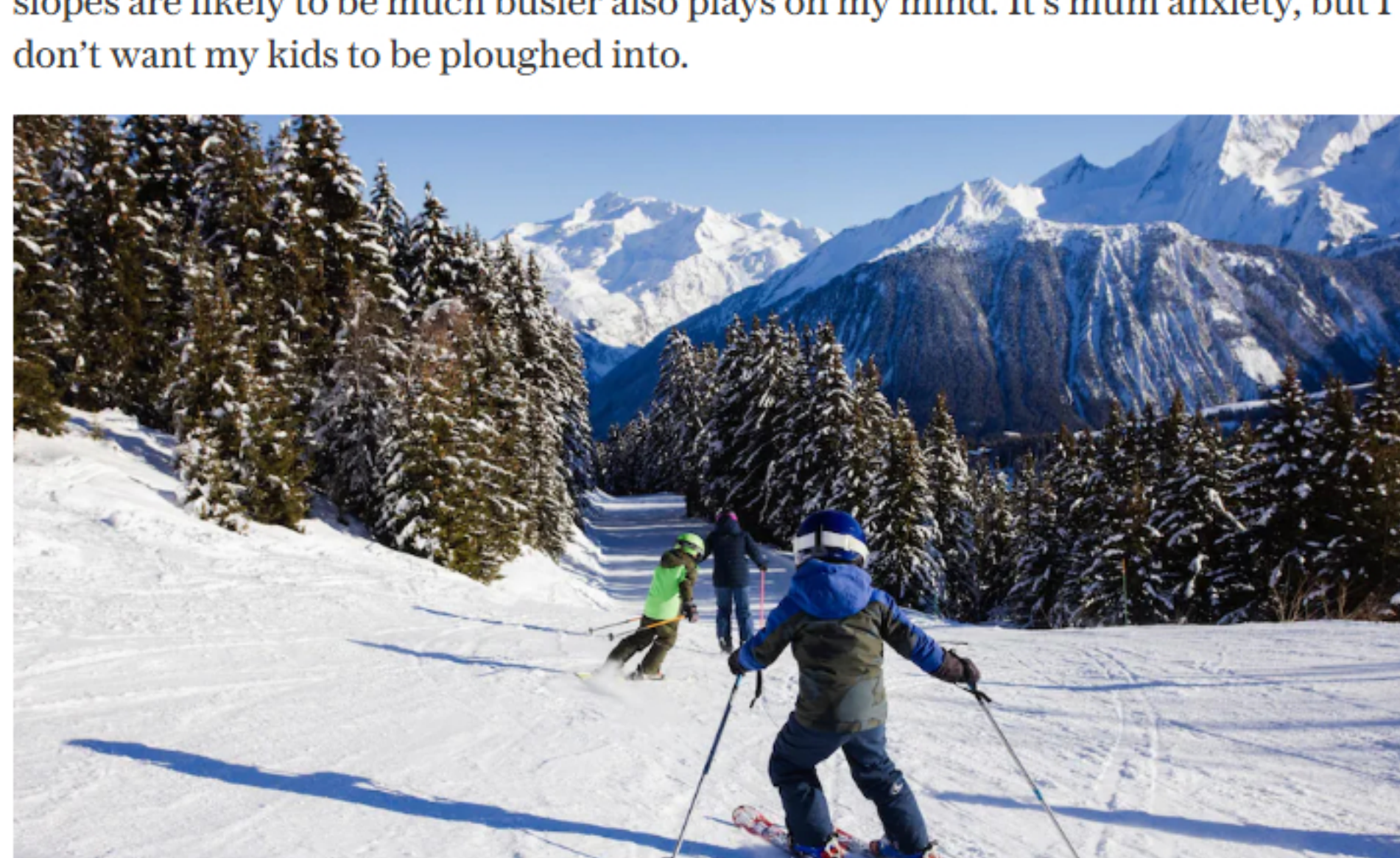
Some parents see skiing during term-time as a safer option, due to quieter slopes

“My kids have only done two weeks of ski lessons, so the fact that lessons and the slopes are likely to be much busier does play on my mind. It’s mum anxiety, but I don’t want my kids to be ploughed into.