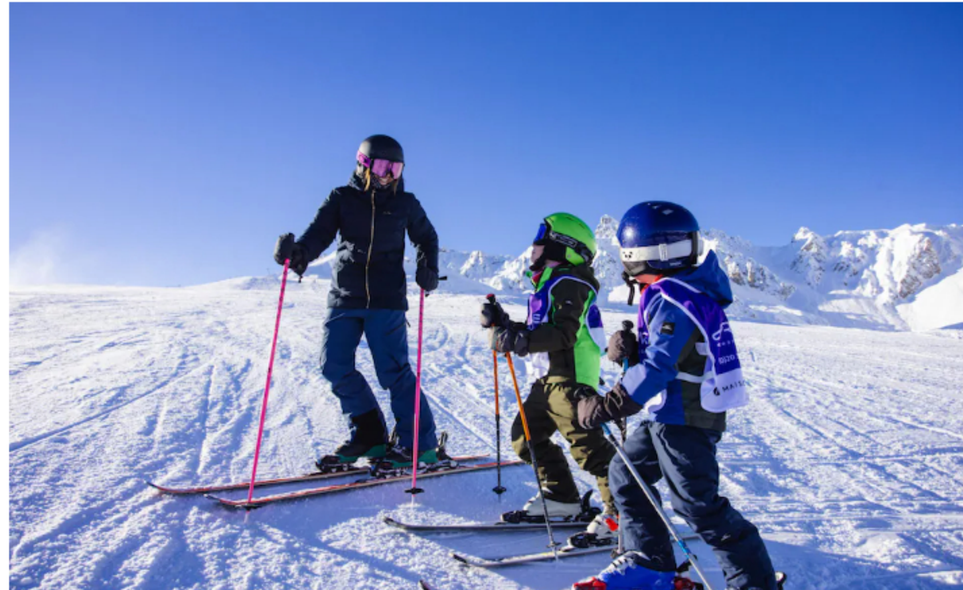
Some parents are happy to risk a fine in order to take their children skiing